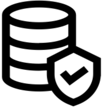
Secure Usage Access