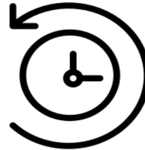
S3 Backup option